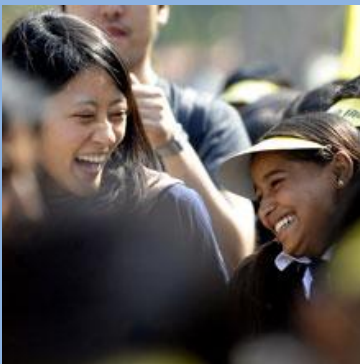
Top: Ambulances driven by Kurauchi's medical team share the road with a boat swept away by the tsunami.