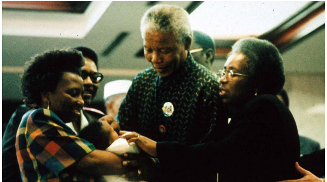
Nelson Mandela immunizes a child at a Kick Polio Out of Africa event in 1996.

In 1996, routine polio immunizations in Nigeria and other African countries were anything but routine. Competing health priorities and lack of funding hampered many governments from putting polio eradication high on their agenda. The drive for a polio-free Africa needed a playmaker.