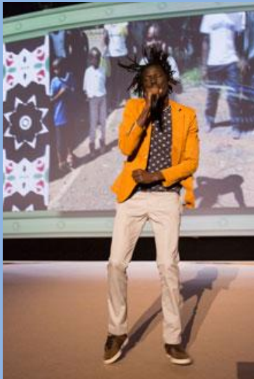
South Sudanese former child soldier Emmanuel Jal, now a peace activist and hip-hop artist, performs during the second plenary session.