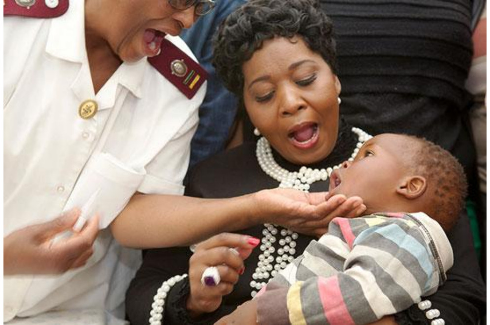
Bongi Ngema-Zuma, first lady of South Africa, helps coax a child to open his mouth for the oral polio vaccine at the Levai Mbatha Community Health Center 11 May.