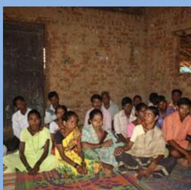
Top: A woman in the Thane district of northwest India carries water back to her village. Bottom: The evaluation team meets with villagers.