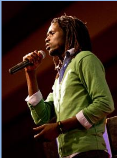
Emmanuel Jal, former Sudanese child soldier and now a recording artist, speaks at the Rotary World Peace Symposium's opening plenary session, 3 May, in Bangkok, Thailand.