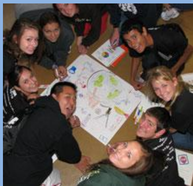
RYLarians participate in a leadership exercise during a conference for District 5190 (California and Nevada, USA).